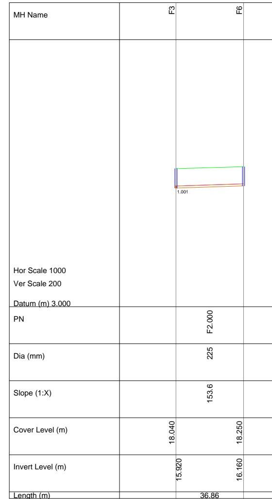
Section F6 to F3